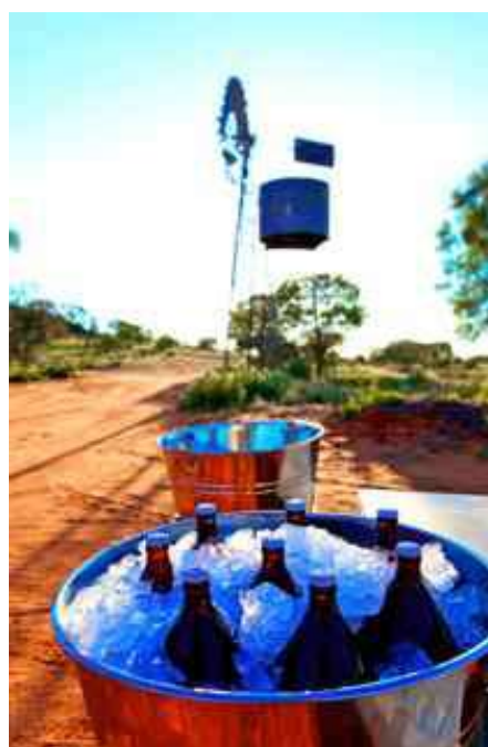
ANZSOC 2010 Conference Dinner, Alice Springs

The Society may be contacted via pscatpeshawar@yahoo.com .