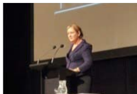
The Hon Delia Lawrie MLA